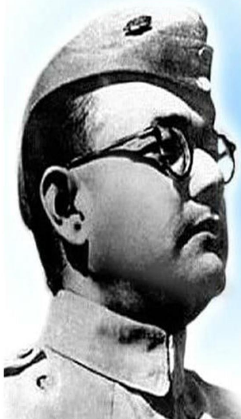
Subhash Chandra Bose Aapda Prabandhan Puraskar-2024